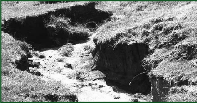
Nearly 30% of New Zealand's farmland suffers from erosion. Loss of topsoil is only part of the problem. Loss of productivity, reduced water quality and silting of estuaries and harbours are all products of soil erosion.