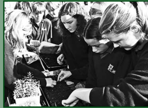
By growing and planting trees, children learn about the role of trees in the environment. They also have the opportunity to become involved in environmental restoration.