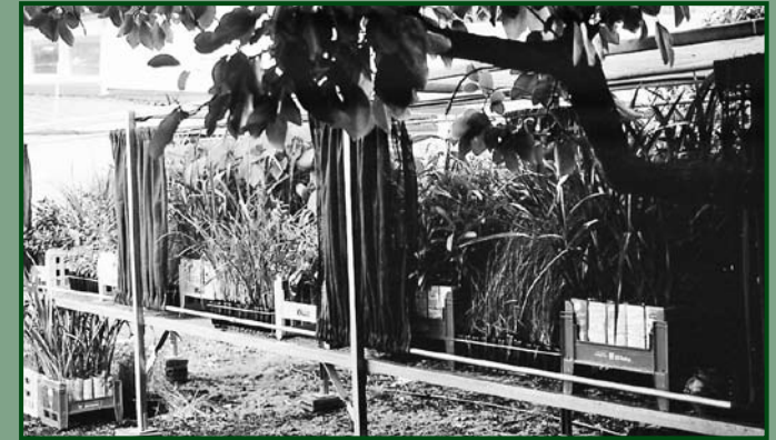
Children grow plants in a specially designed Plant Growing Unit (PGU) until seedlings are ready to be planted.